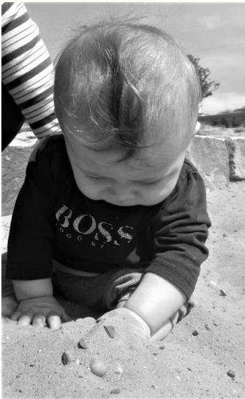
CHARLIE EXPLORING SAND