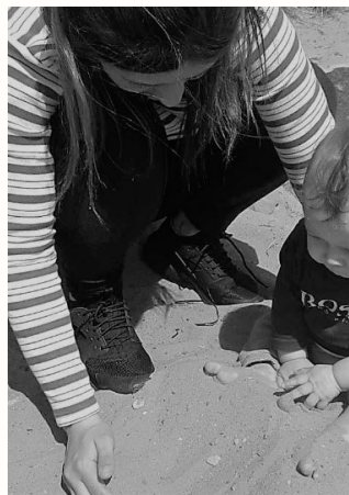
PLAYING AT THE BEACH

Whilst these parents have helped us to write their story and have given permission for it to be shared with you, their names and any identifying information have been changed to protect their identity.